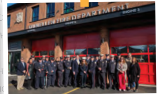
GEORGE W. HODULIK FIREHOUSE REOPENING