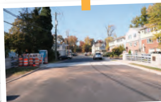
COMPLETION OF PULASKI STREET CULVERT

Incorporated 1887 | 7,711 population 2,725 housing units | Median age: 41.7 Median income $84,789 | 245 School children: 623 in elementary, 300 in middle & 388 in high school 13% of population is senior citizens 63% of housing is owner-occupied 37% of housing is renter-occupied 3.1 average family size